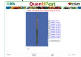
Screen shot of a training program developed under QuantiPest

Training programs are provided to improve users' ratings or identification skills of various pests or injuries. New training programs using various sets of multiple-choice questions based on pictures can also be developed