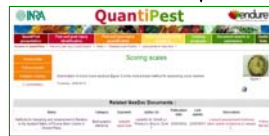
Screen shot showing a knowledge valorisation page that includes text and pictures. Related documents are listed at the bottom of the page.