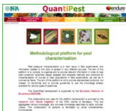
Screen shot of the presentation page of QuantiPest with the menu on top, which allows to access the various sections.